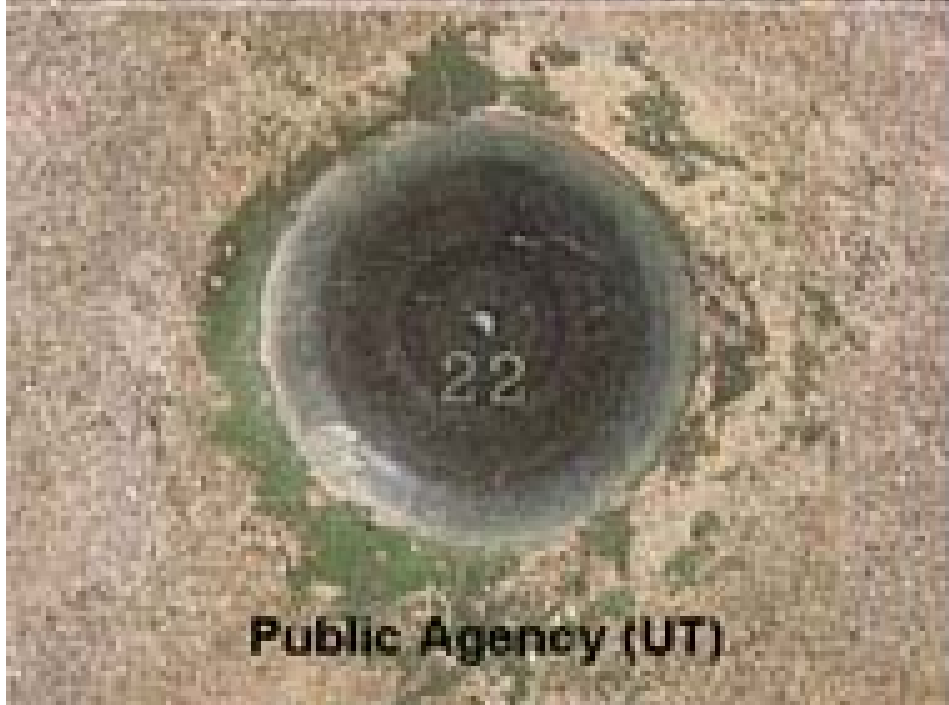
Public Agency (UT)