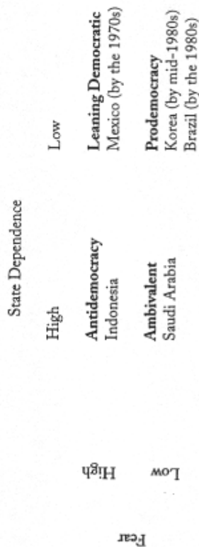
FIGURE 1 PRIVATE SECTOR CAPITAL: CHAMPION OF DEMOCRACY?

strength of the capital poor (for example, membership levels in the Communist Party), and past incidence of popular violence. Labor's dependence on the state will be measured in terms of union dependence on state subsidies and union members' access to state-subsidized benefits (for example, credit and housing), as well as the politically manipulated (inflated) setting of wage levels. Labor's aristocratic position will be measured in terms of differentials found between the organized and unorganized in matters of wage levels, access to stable employment, social security, and other nonwage benefits such as legally mandated job security. While these variables are not exhaustive, they anticipate a great deal of the variation found in class commitment to democracy, both among cases and even more powerfully within cases across time. A schematic summary of the argument and positioning of the cases is presented in Figures 1 and 2.